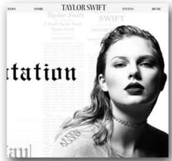
TAYLOR SWIFT WEBSITE

How to use: Use this Knowledge Organiser to identify the similarities and differences between the music video and the website