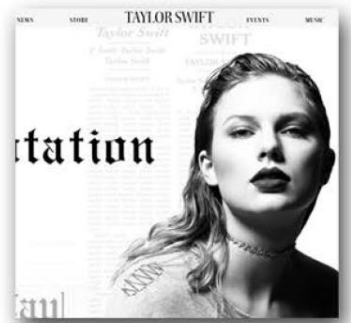
TAYLOR SWIFT WEBSITE

How to use: Use this Knowledge Organiser to identify the similarities and differences between the music video and the website